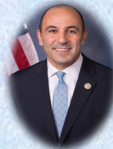
Congressman Jimmy Panetta