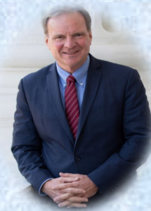
Senator Dave Cortese