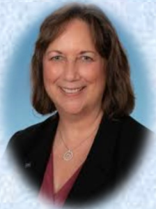
SJ Vice Mayor Pam Foley