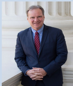
Dave Cortese State Senator