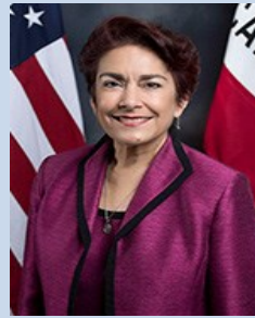
Anna Caballero State Senator